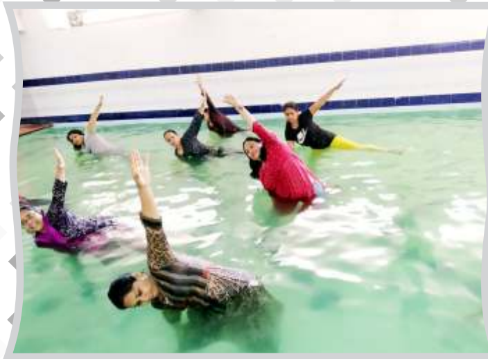
Teachers doing Aqua Yoga with full concentration