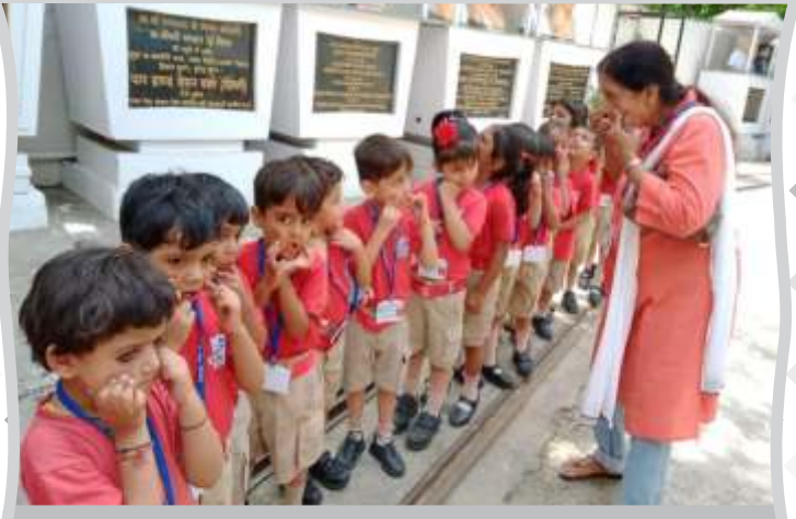
Teacher explaining about the sense organ