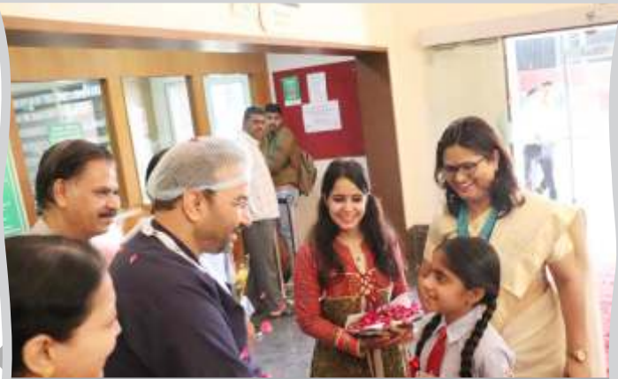
Sharing smile, great moments with doctors