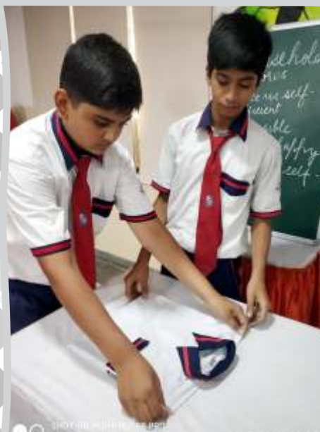
Folding the shirt