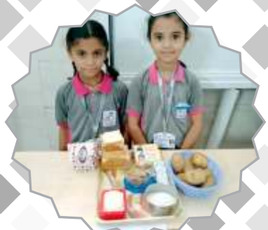
Healthy food healthy life