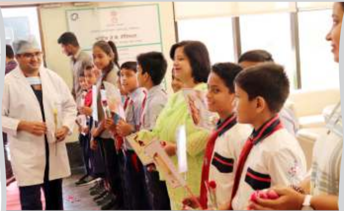
Excited students welcomed the doctors