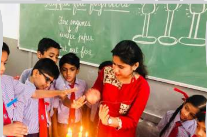
Be careful with fire