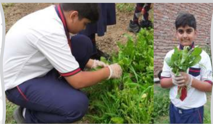
Be close to nature