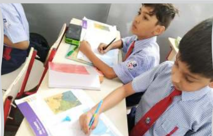
Involved in the study of mapping