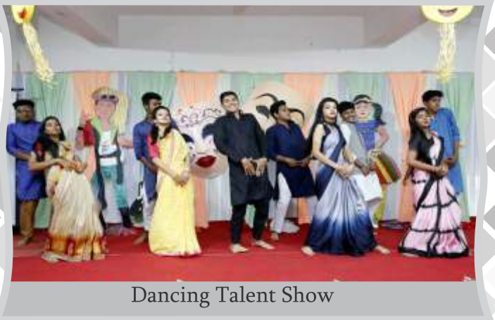
Dancing Talent Show