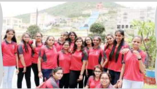
Learning about history of Mewar