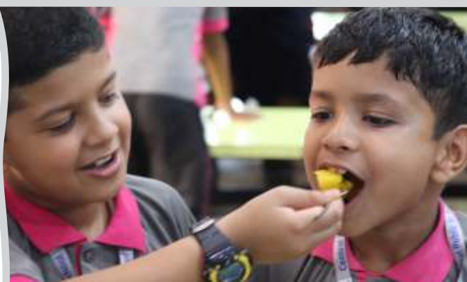
Learning to share with peer group

'Daan' is considered to be highly divine in all religions; sharing gives strength to our inner energy, we feel true happiness when we share, care and serve.