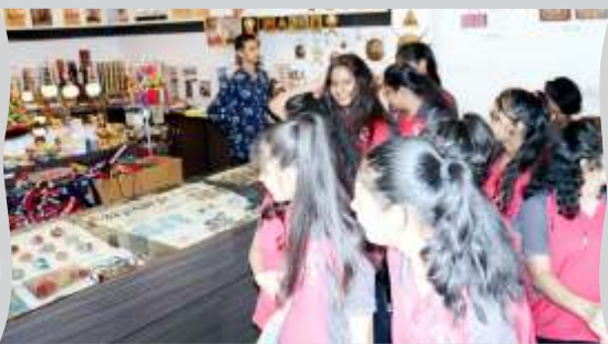
Hostel students enjoying a day out