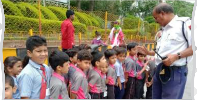
Meeting the traffic police officer

The nation can only be educated when it's citizens become sensitive to civic sense.