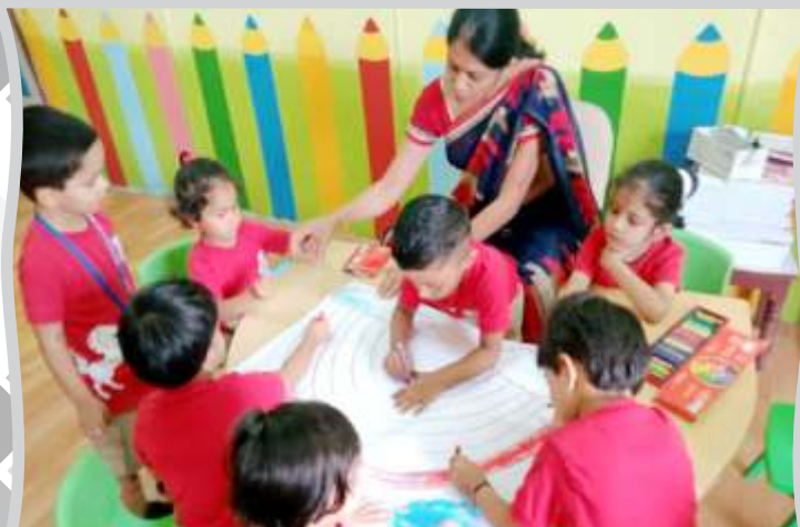
Understanding and doing