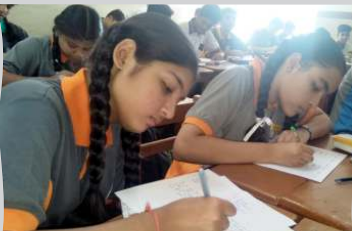
Students putting heart & Soul to give their best

Calligraphy is an old powerful art form of effective written communication which has a nostalgic charm and consistent stylistic trend. This art is kept alive at CPS by conducting Calligraphy competitions both in Hindi and English for classes one to tenth. The students wrote small and big alphabets, words with complex lettering and a passage to exhibit their artistic and stylish skill in calligraphy. A good number of enthusiastic students took part in the competition.