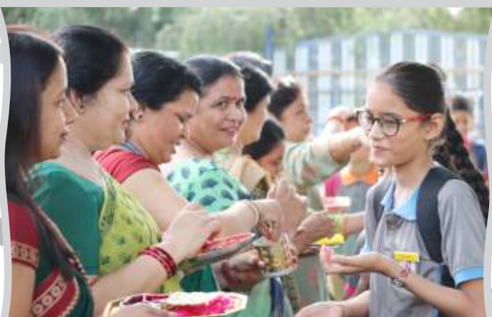
Traditions are integral part of CPS teacher