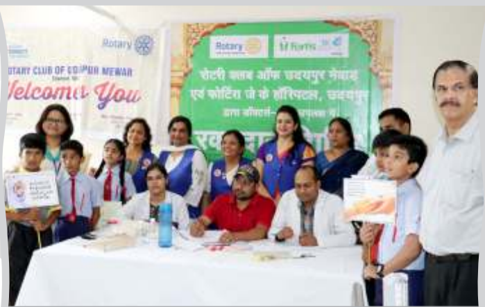
Students team at Fortis to pay respect on Doctors Day