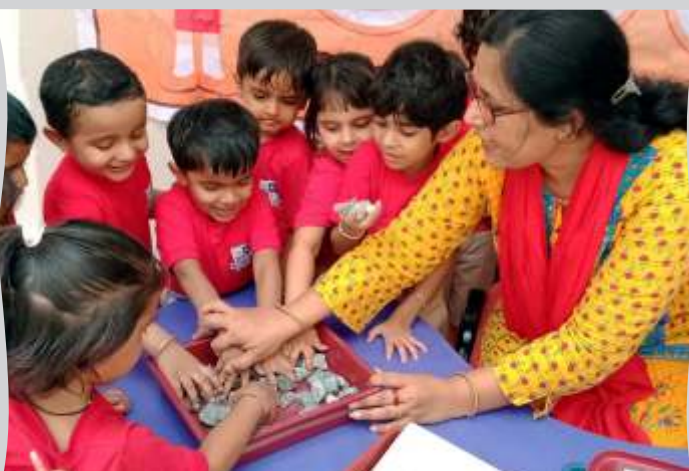
Experiencing the sense of touch