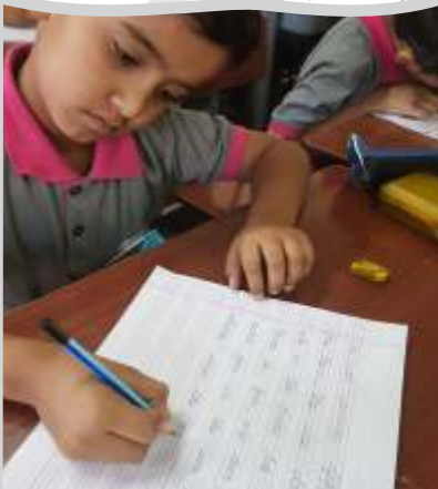
The art of calligraphy

Calligraphy is an old powerful art form of effective written communication which has a nostalgic charm and consistent stylistic trend. This art is kept alive at CPS by conducting Calligraphy competitions both in Hindi and English for classes one to tenth. The students wrote small and big alphabets, words with complex lettering and a passage to exhibit their artistic and stylish skill in calligraphy. A good number of enthusiastic students took part in the competition.