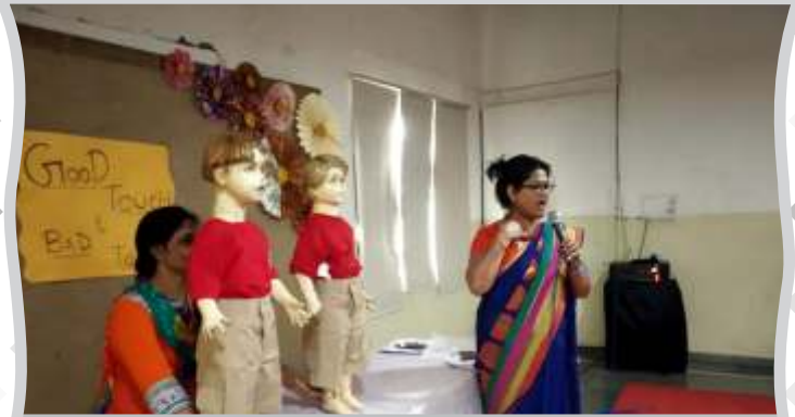
What is safe circle-understanding

Learning about Good touch and Bad touch in a v gentle manner. CPS Principal made the students of class 1 aware of safe circle Bad touch how to say no and if anything is bad share with mummy immediately.