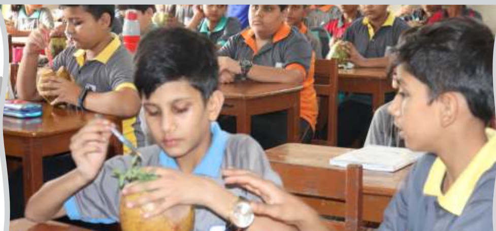
Environment friendly using empty Green Coconut shell planting pot