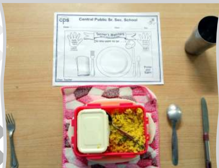
Eating style. The layout

This is the right time to learn table manners and CPS is an early bird in imparting holistic learning to it's students. These little kids were given worksheet with the instructions laid down on how to follow table manners and they did their practical activity using Fork, Knife and Spoon.