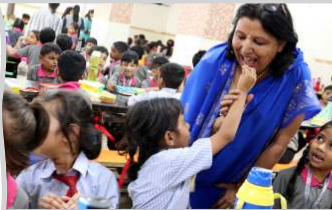
Sharing with the Chairperson

Whenever we share/care we get true content in life. If our kids learn to share at young age they grow up to become caring, humble and responsible adults