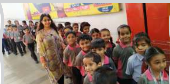
Entering the Reliance Mart

In series of 'sense organ' Activity based learning Students of Pre Nursery and Nursery class saw models of eyes, nose, tongue teachers also showed the big cut-outs of sense organs kids tasted sweet, salty, bitter, sour edibles and learnt to differentiate their taste.