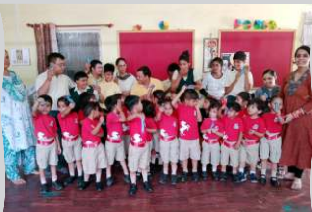
CPS Junior-Visit a school for special children