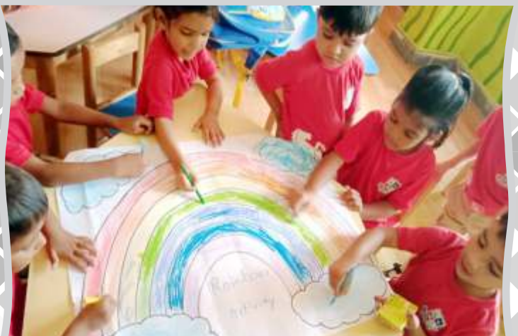
Colours of rainbow

Kids learning the concept of similar and different. They also learned to sort and differentiate and at the same time, from the same activity, learned the 7 colours of rainbow.