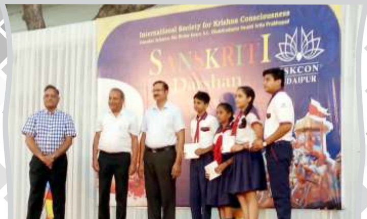
The presenters and the awardees