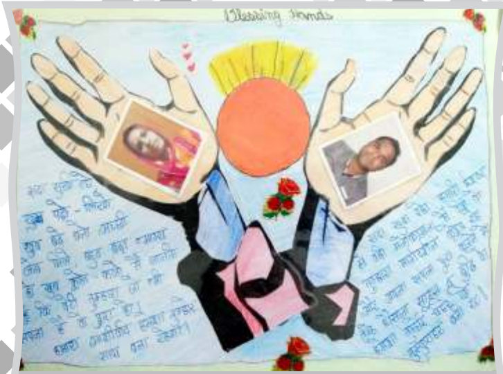
Picture of the palm with pasted parents' photos

During the spiritual development month CPIANS learn that inner energy can be manifolded by 5 powers. To learn power of blessings children made table mats. Drew pictures of palms. They pasted pics of parents on the palms and the Parents wrote message of blessings there. These were laminated, now children will keep their tiffins on these mats and have food and will absorb the energy emitted by these blessings. Parenting tip: always bless your child openly. Learn the art of blessing. Bless specifically and loudly.