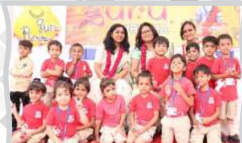
The Tiny Tots with their Gurujans