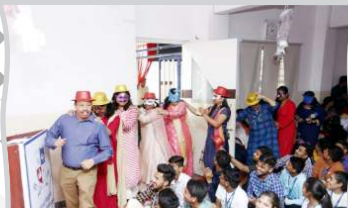
Management sharing light hearted moments in "Happiness Segment".