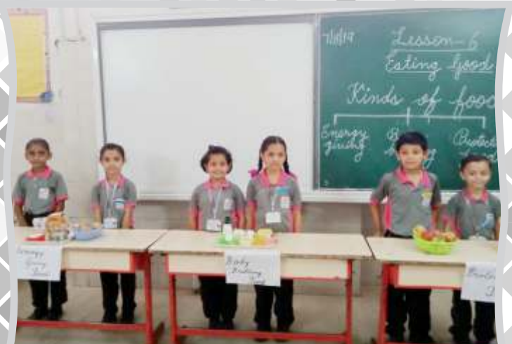
We can explain different kinds of value food

Grade II Students demonstrated different kinds of value food like ENERGY GIVING FOOD, BODY BUILDING FOOD AND PROTECTIVE FOOD. Students spoke on it with knowledge and enthusiasm.