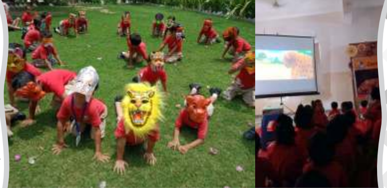
Picture of the big wild cat