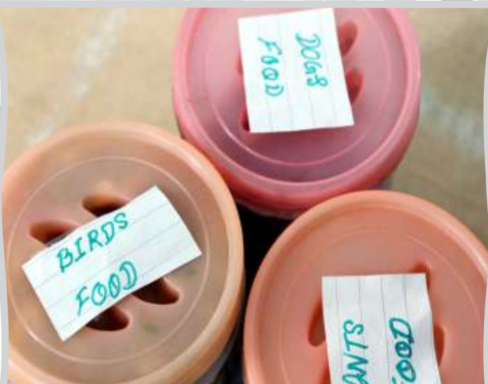
Serve food to birds, dogs and ants

'Daan' is considered to be highly divine in all religions; sharing gives strength to our inner energy, we feel true happiness when we share, care and serve.