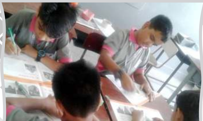
Drawing some famous monuments