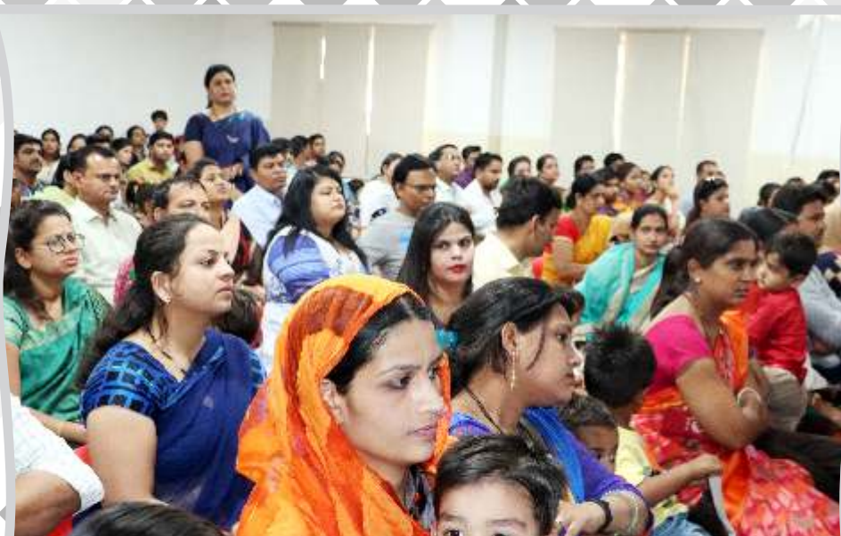
Engrossed parents enjoying Chairperson's address