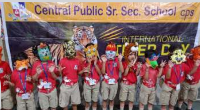
Wearing animal mask

Tiny Tots of CPS Junior celebrated International Tiger Day to create the awareness on Save Wild life. The students came to school wearing a Tiger mask. A movie on Tiger was shown to the student who learnt a lot about this big cat.