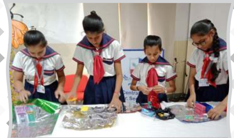
Following the procedure