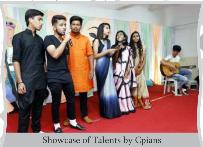
Showcase of Talents by Cpians