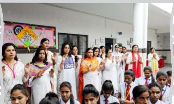
After meditation, Students taking blessings from Gurujans