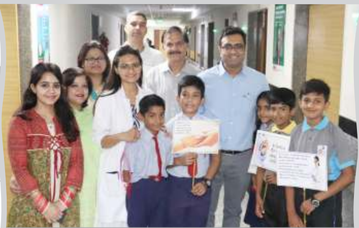
Team CPS with Doctors