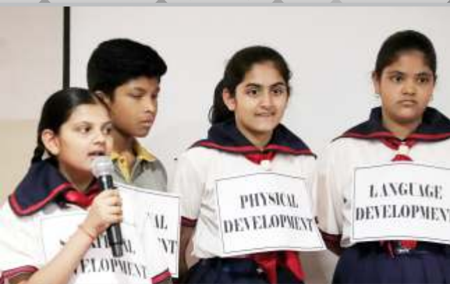
Students displaying the 8 Golden Mantras and proudly explaining

Parents Orientation Program, at the beginning of the academic year for all classes serve as an excellent platform to bond school, parents and students for the common goal and progress of the child.