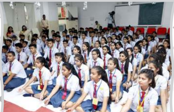
Students exhibiting their learnings