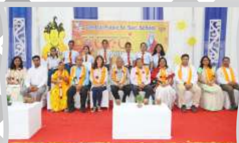
The Chief guest and guest of honour on the dais