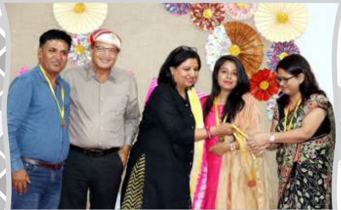
Medals to the New Teachers