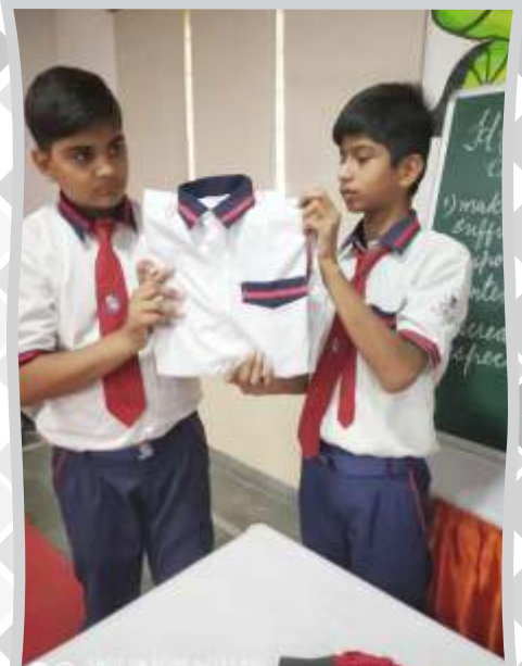
See the folded shirt

Young Cpians learnt to fold clothes and to keep their wardrobe organized. A clutterfree wardrobe is the sign of a clear organized ,disciplined personality. Clutter is the reflection of misfortune Each child must be self-sufficient and confident person.