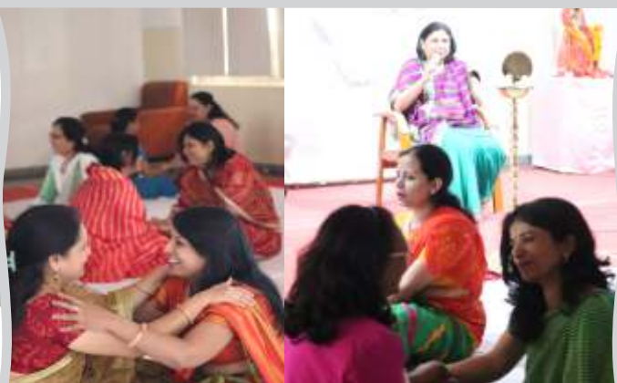
Learning the philosophy of CPS naturally