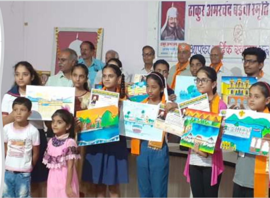
The world of creation-Beautiful and Colourful