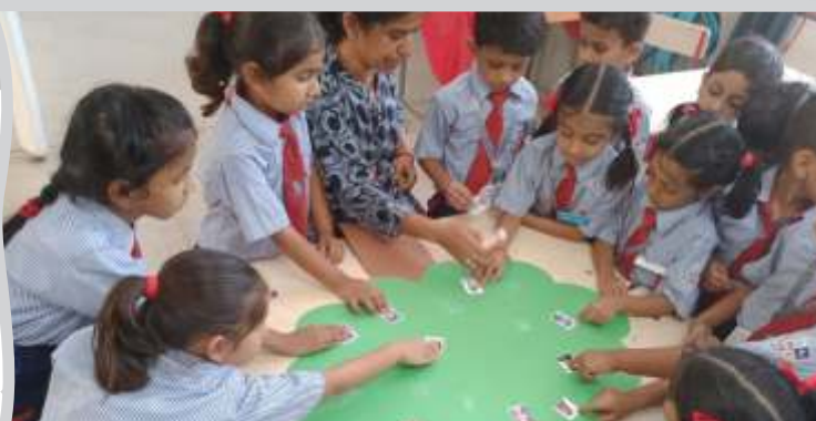
Lets help each other