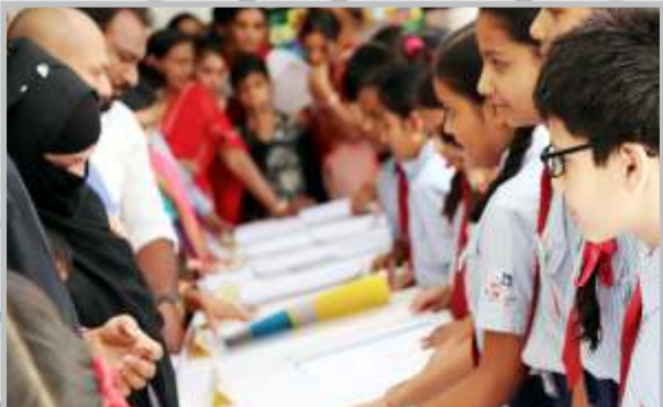
Parents enjoying and feeling happy to hear from students