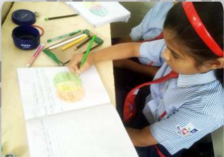
Learning by doing-Activity in class

Nature is the best teacher anyone can ever get. The green essence fills our heart, mind and soul with happiness and tranquility. The environment club of CPS explored education beyond the classroom into mother nature's lap. Basic agricultural techniques, sowing and ploughing were taught in the school's vegetable garden. Lessons about healthy and organic lifestyle were also given.