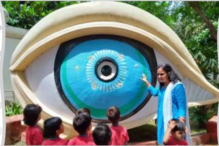
See the big eye