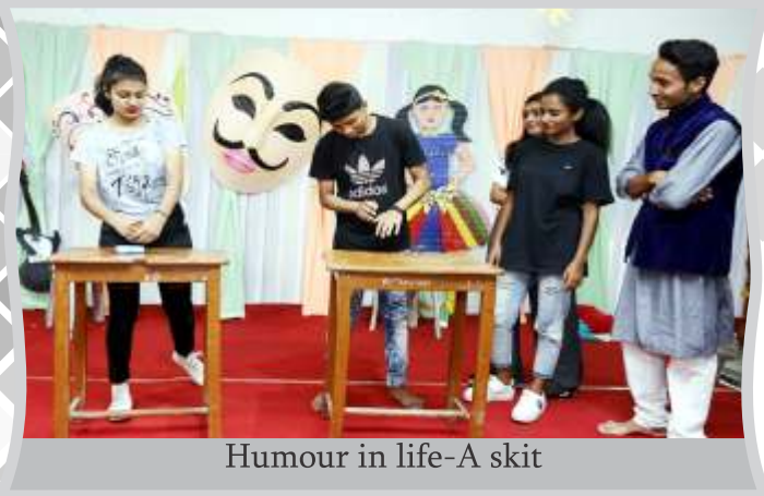
Humour in life-A skit