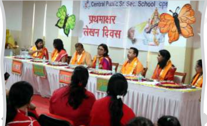
All members ready to guide kids to write 1st letter 'OM'