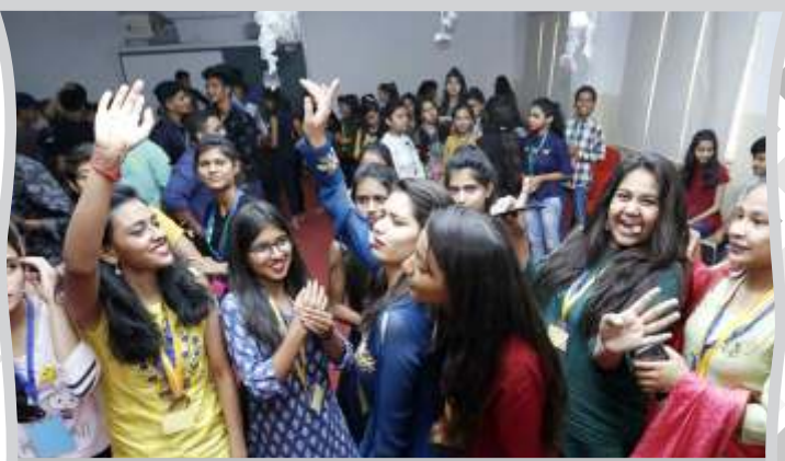
Students Dancing Happily