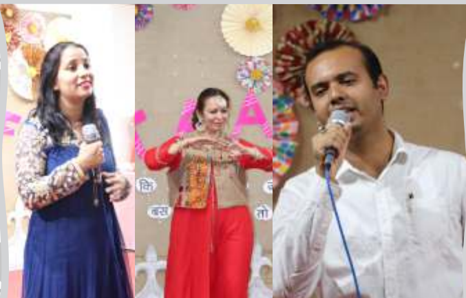
New Members of Parivar showcasing their talent