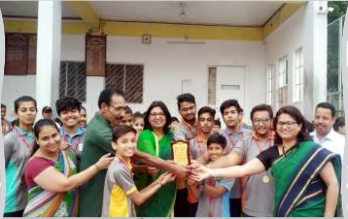
Joy of Achievement

Big Achievement : CPS won 1st position in all four categories of Inter School Singing Competition- Anuvrat. 1st position in Solo Junior 1st position in Solo senior 1st position in Group song- Junior 1st position in Group song- Senior Heartiest Congratulations to the entire CPS family. Well done Music team.