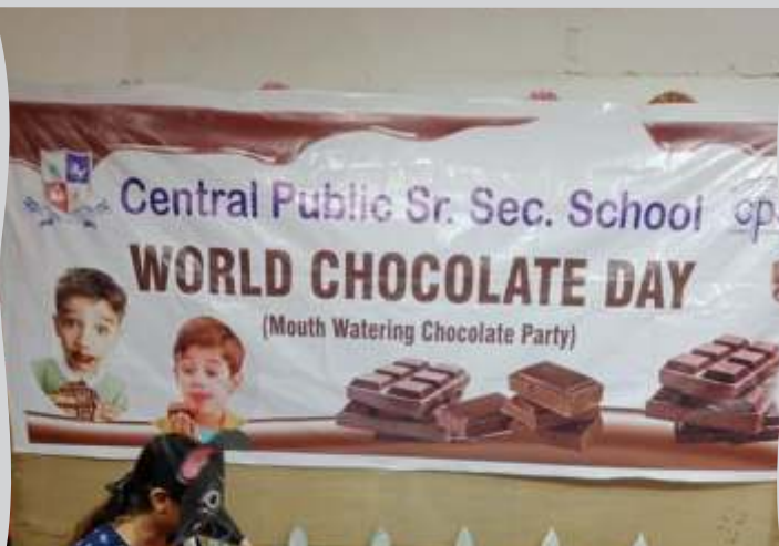
Celebrating Chocolate Day