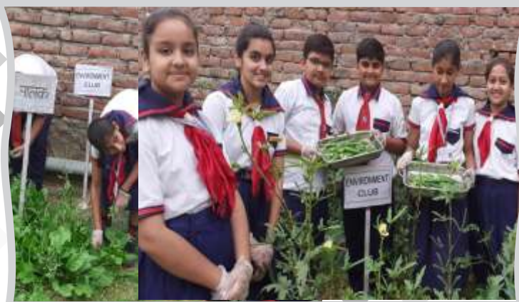
Love green life