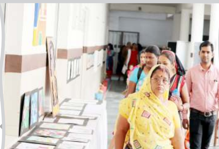
Display of student's work