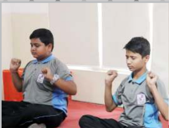
Demo of Pranayam