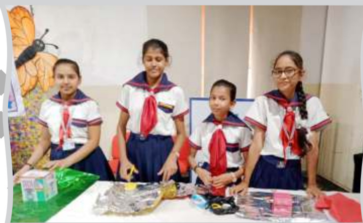
Working to the final stage