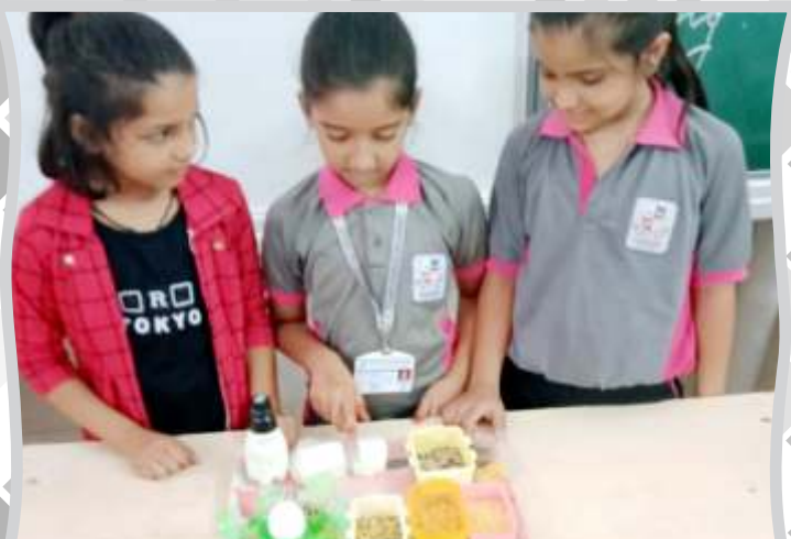
Know what is value food