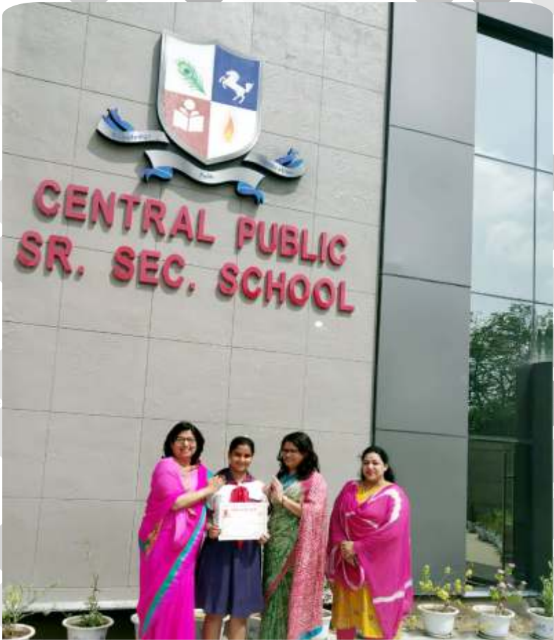
Receiving the honour