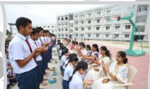
Receiving blessings of Gurujans