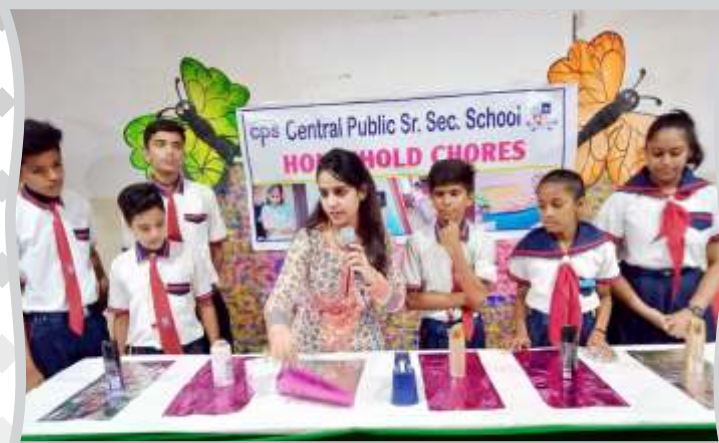
Ready with the materials