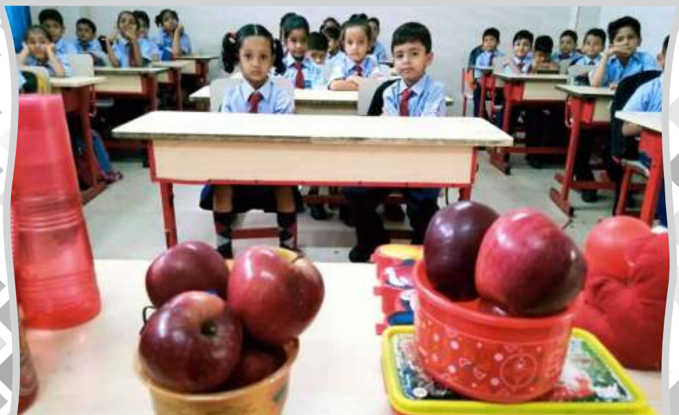
Red Shining apple in the basket for study