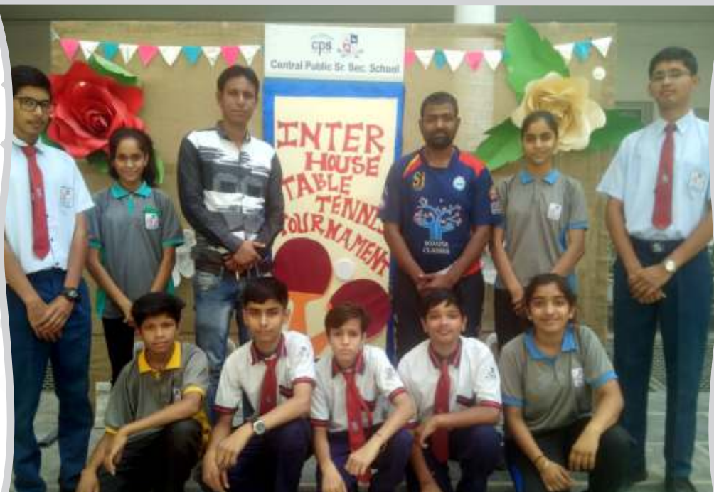
Proud winners with their coach