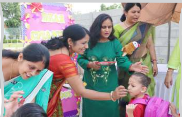
Tiny Tots enjoying a warm welcome