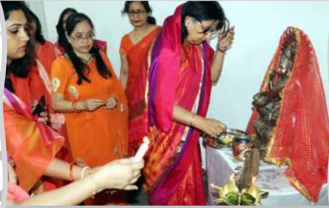
Invocation for divine guidance to Ma Sarswati