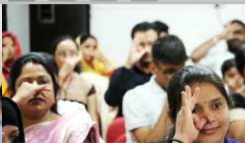
Enthusiastic Parents enjoying Pranayam in School