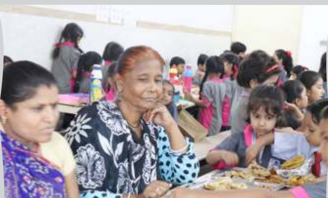
Students sharing food with ancillary staff. Learning to love all

Whenever we share/care we get true content in life. If our kids learn to share at young age they grow up to become caring, humble and responsible adults