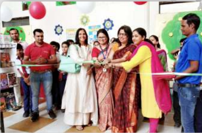
Inauguration of book fair