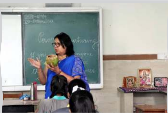
Nurturing gives power to our inner self