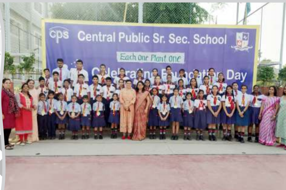
The Pranayam Champions