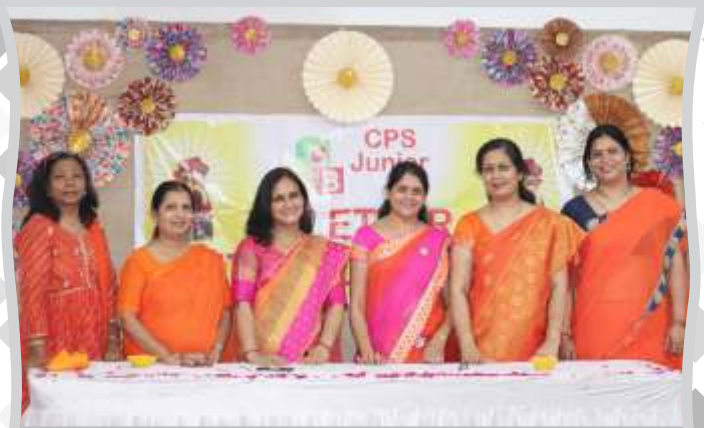
Gurujans ready to guide and support