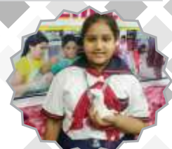
Folding napkins into different shapes