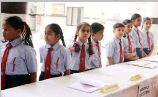
Students eagerly waiting to share school philosophy with parents