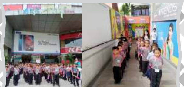
Going around the place