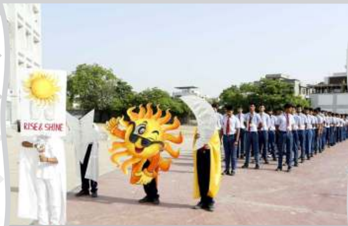
Parade to declare the camp open