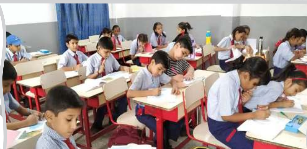
Learning by doing-an important aspect of CPS education system

Aim: locating my state and other states.