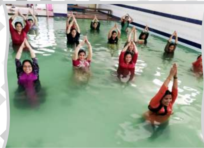
Aqua Yoga for more strength & power