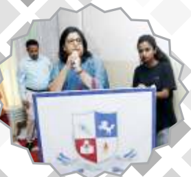
Revision of all the skills that were taught to them in past 14 years