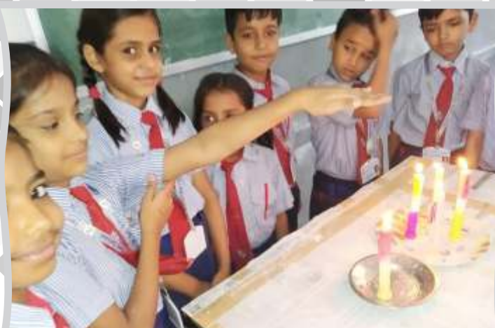
Any fire gives flame, light and heat

Aim: To take care and beware of burning object activity : burning candles and incense stick , To understand that