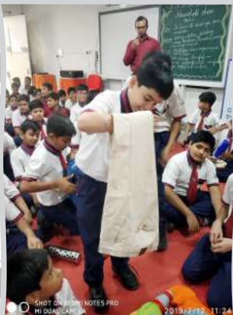
Learning to fold clothes