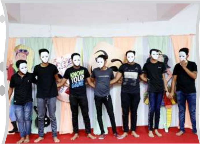
CPAINS Showcasing social issues