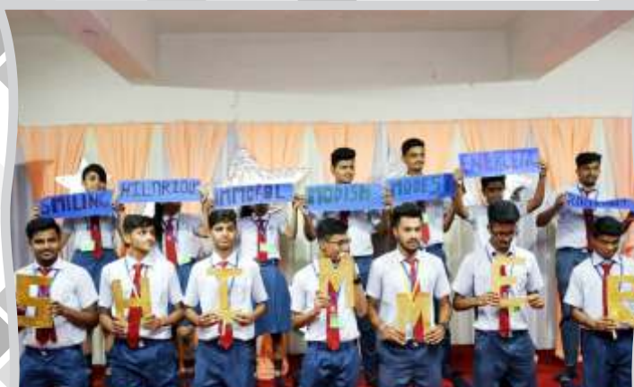
Group Introduction segment- Winning group