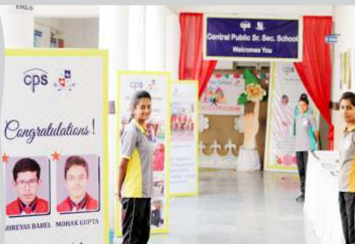
Welcome of parents