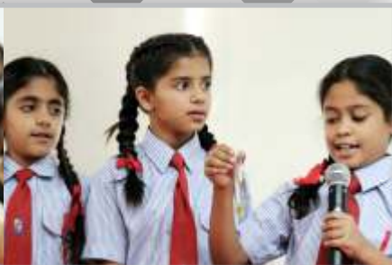
CPS Methodology-Learning by doing