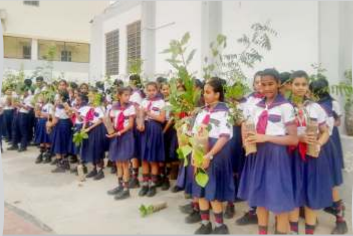
Me and my plant