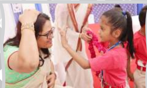
The Juniors Welcoming the Principal and honouring