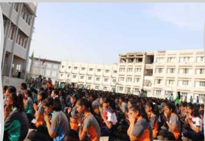
Morning assembly on the first day

When kids feel care, concern and warmth they automatically blossom and flourish