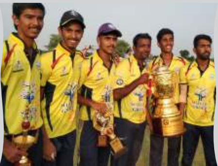
The best players how proud they are!