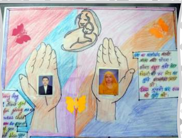
Full view of the matter with palm, parents' photo and blessing message