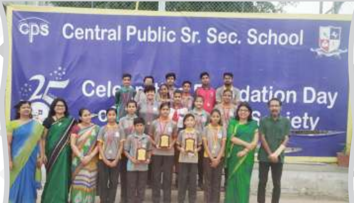
The Winners of Anuvart Singing Competition

Big Achievement : CPS won 1st position in all four categories of Inter School Singing Competition- Anuvrat. 1st position in Solo Junior 1st position in Solo senior 1st position in Group song- Junior 1st position in Group song- Senior Heartiest Congratulations to the entire CPS family. Well done Music team.