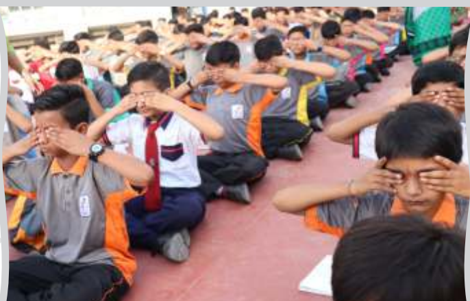
Pranayam-a daily segment of morning assembly

When kids feel care, concern and warmth they automatically blossom and flourish