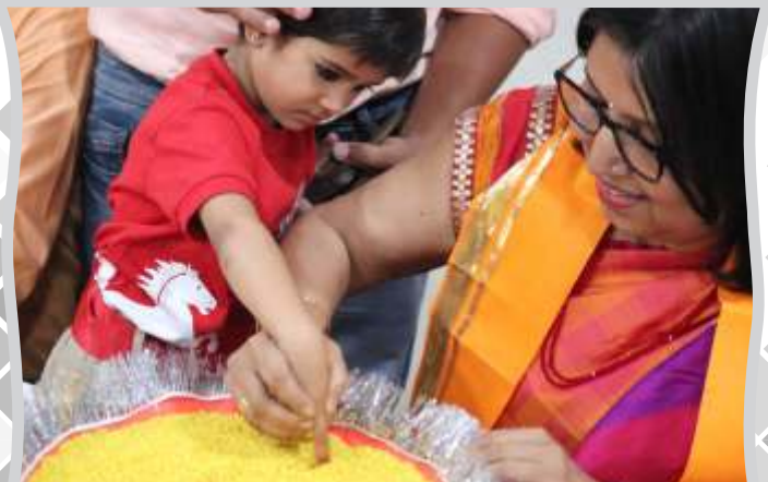
A loving heart, supportive hand guiding the kids