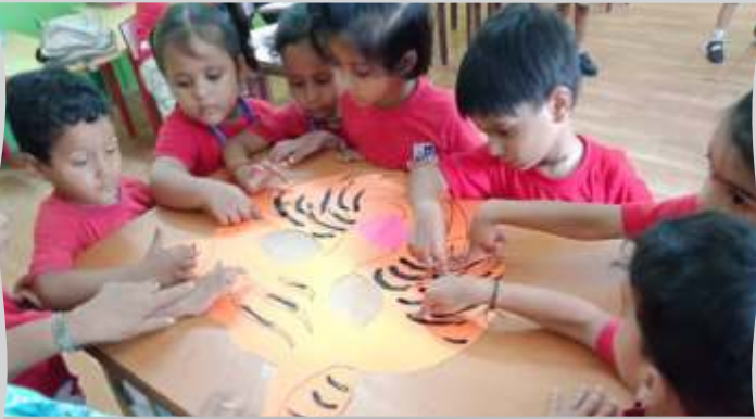
The majestic tiger stripes!