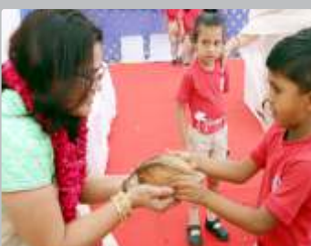
Offering the Puja Coconut