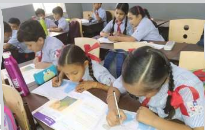
Students finding their location on map