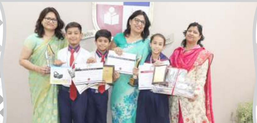
Winners of handwriting olympiad