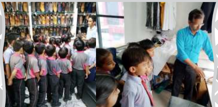
Understanding the service of our service providers