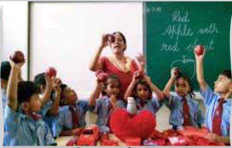
See my fruits

While doing this they touched, felt, and understood that apple is hard banana is soft, Apple is red outside while white inside, It has few black seeds, Pomegranate has many seeds, Now this is practical knowledge, whenever a child will eat any fruit, he will say its colour, size, texture etc. CPIANS learnt about 26 fruits like this.