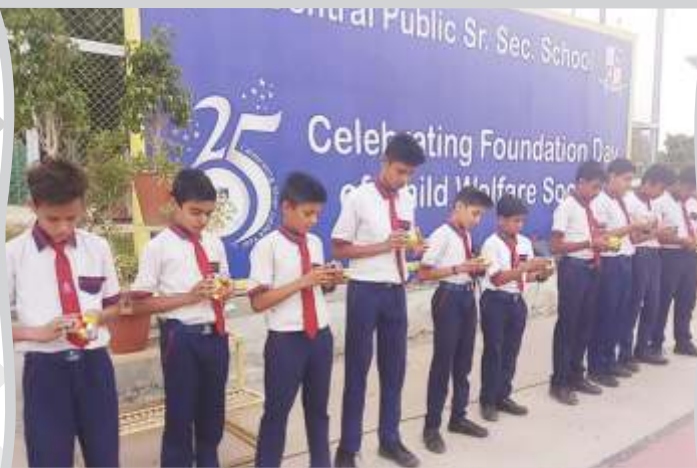
Ready to start the competition