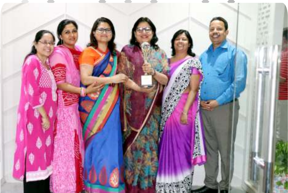
Grand moment of sharing the happiness

Yet another glory! The Indian Education Awards Jury has conferred the “Best School Working on Interpersonal Skills Award” to CPS at the Nations Biggest Education Conference and Award show on 4 th May 2019 at New Delhi. The award was presented by the Ambassador of Belarus. A grand achievement for the school.