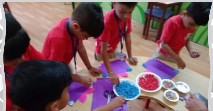
Preparing for the job of making the frame

CPS has always believed in Value based Education. In order to inculcate these values, the activity of making frame for family photo was conducted in school. Cpians know the importance of family which is above everything else in the world. They were made to understand while making family photo frame that our priority in life is family not money. The parents would write their blessings on these photoframes to teach the power of blessing in life. It was clearly communicated how our family is important and very dear to us.