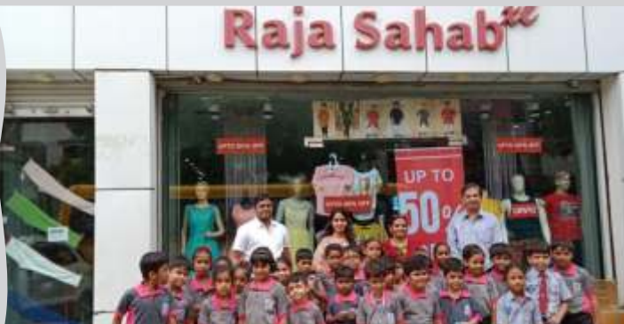
The visiting team of students