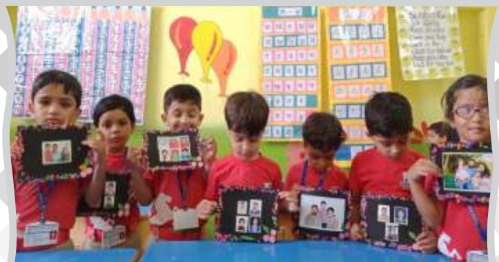
See my Photo Frame!