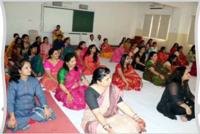
EXCHANGING THE INTRODUCTION; GETTING MERGED WITH WARMTH