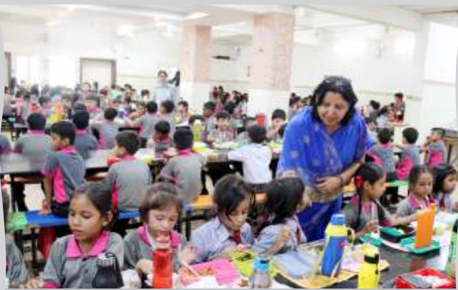
Sharing with the Chairperson