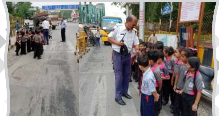
Following the instructions of the traffic police officer