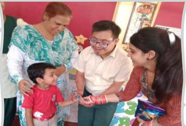
A chocolate for everyone