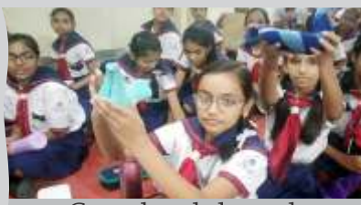
Completed the task

To learn household chores is essential for self respect, selfconfidence and to be self sufficient. All children should start doing household chores from the age of three. Parents doubt and think that it is too early and get disturbed by the mess they make. When children grow they lose natural interest in doing household chores. It is very sad but true. This day all worked with motivation and they learnt the activity of folding napkins.