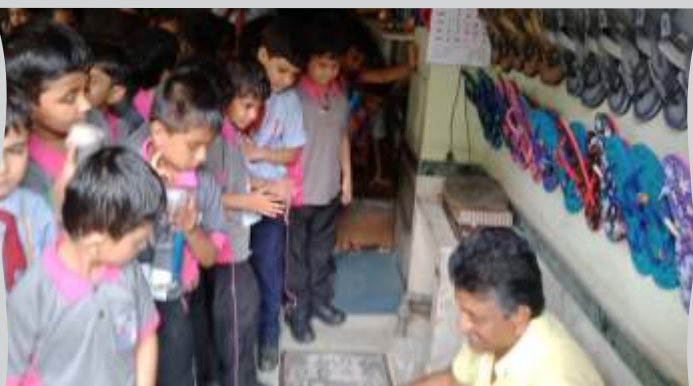
Cobbler's work of art

A visit to the Cobbler shop and the Tailor shop helped them understand about different professions and our helpers. Technology has made people very self centered and to make our young Cpains sensitive and grateful, they were shown how much hard work is required to make shoes or stitch clothes. No work is small and to show gratitude it is our duty to honour this labour. If we are not using any pair of shoes for any reason, it is better to give it to someone to make good use of it.