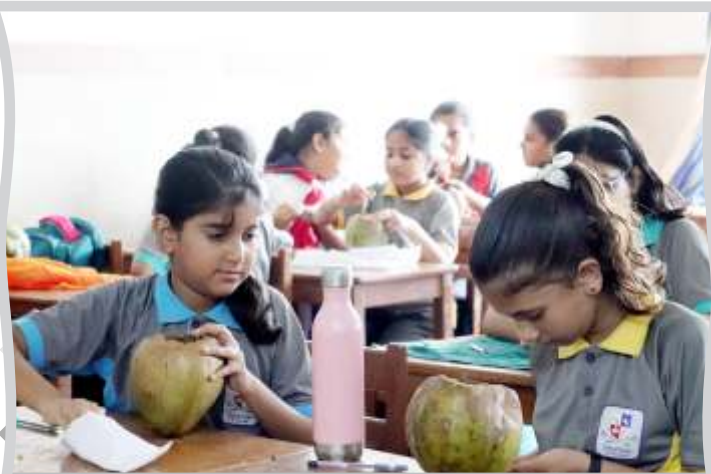
Students brought organic pot to grow plants