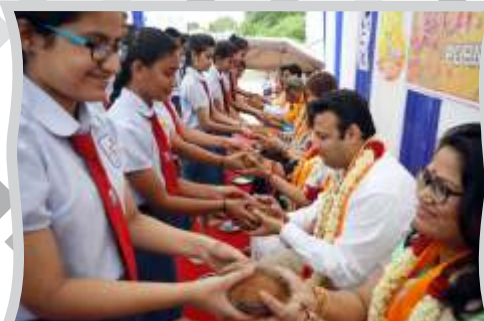
Paying respect of Gurujans