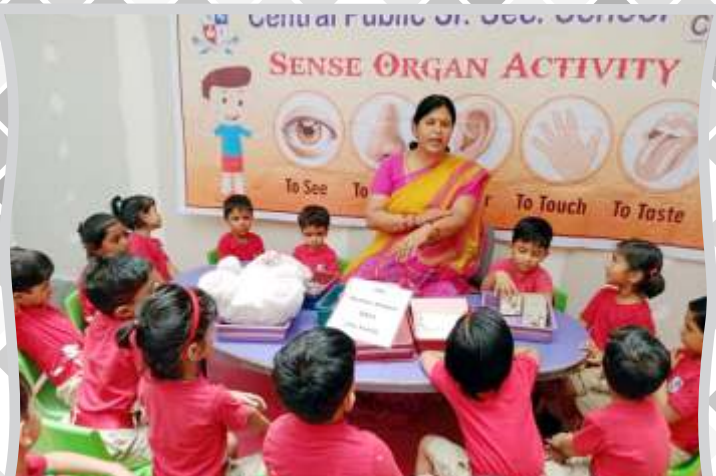
Listening to the teacher

Aim : To know about sense organs and their purpose. Activity : Students touched and felt various things and tasted sweet, sour, bitter, salty things.