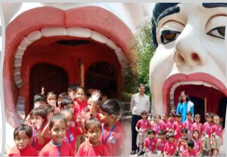
The big mouth - model at Narayan Seva Sansthan

In series of 'sense organ' Activity based learning Students of Pre Nursery and Nursery class saw models of eyes, nose, tongue teachers also showed the big cut-outs of sense organs kids tasted sweet, salty, bitter, sour edibles and learnt to differentiate their taste.