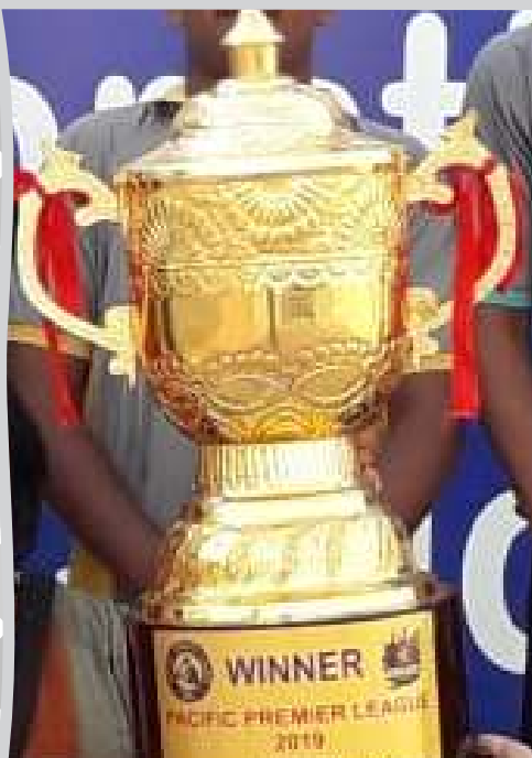
The PPL Trophy