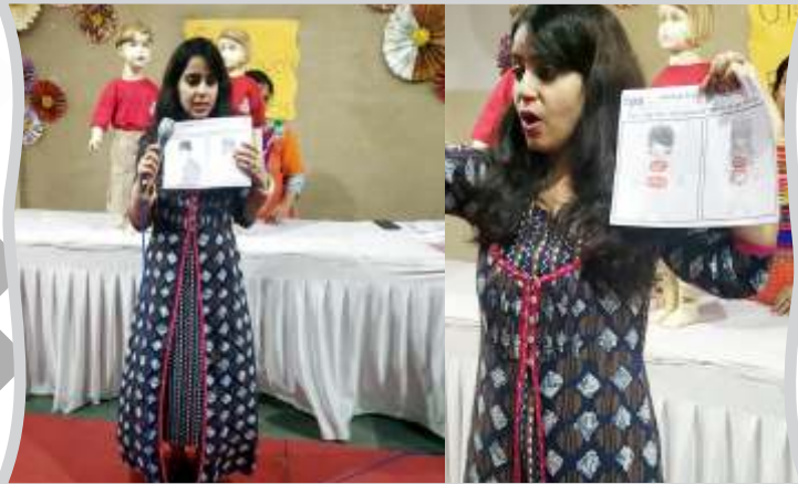
Early awareness is useful