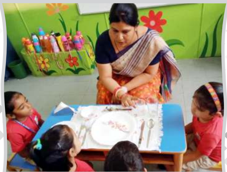
Teaching how to use the cutlery