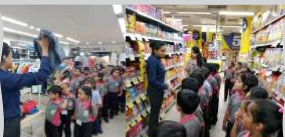
Observing the self-display of commodities

A visit to Reliance Mart. To learn and to see how our community helpers work for us. CPIANS also learned how each member of society is useful. They start observing, appreciating these helpers doing different work for us. This develops thankfulness, attitude of gratitude from an early age .