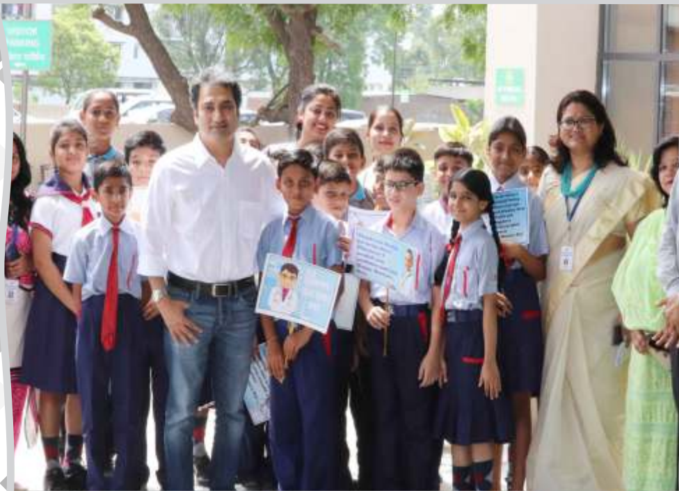
Cpians' gratitude to Doctors for their services

1st July is celebrated as National Doctors Day in remembrance of the legendary Physician and the Second Chief Minister of West Bengal Doctor Bidhan Chandra Roy. To make it memorable students of CPS paid a visit to J.K. Fortis Hospital. They gave a warm welcome to the esteemed Doctors with bouquets and thank you note. Our proud Cpians communicated our gratification to the doctor community, who not only help us in our everyday lives but also have made relentless efforts towards achieving remarkable improvements in the medical field.