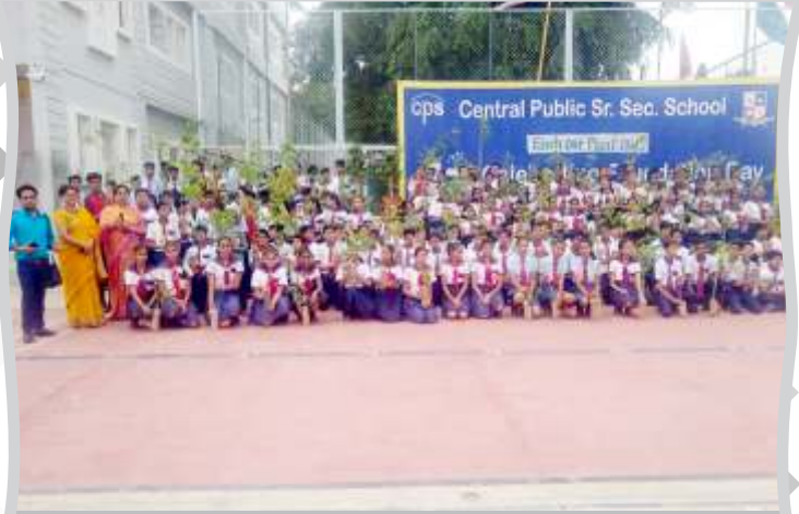
A big group of tree lovers

Future Ki Baat Plantation drive at CPS, 150 CPIANS adopted 150 saplings and they took pledge to take care and nurture these little babies. These kids are doing Future Ki Baat.....Are you ?