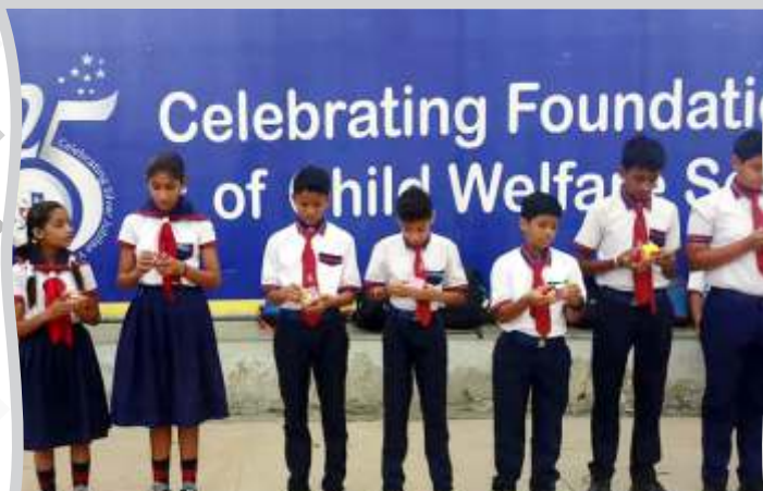
Working on the rubric cube